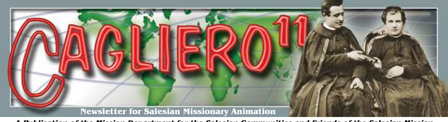
A Publication of the Mission Department for the Salesian Communities and Friends of the Salesian Mission